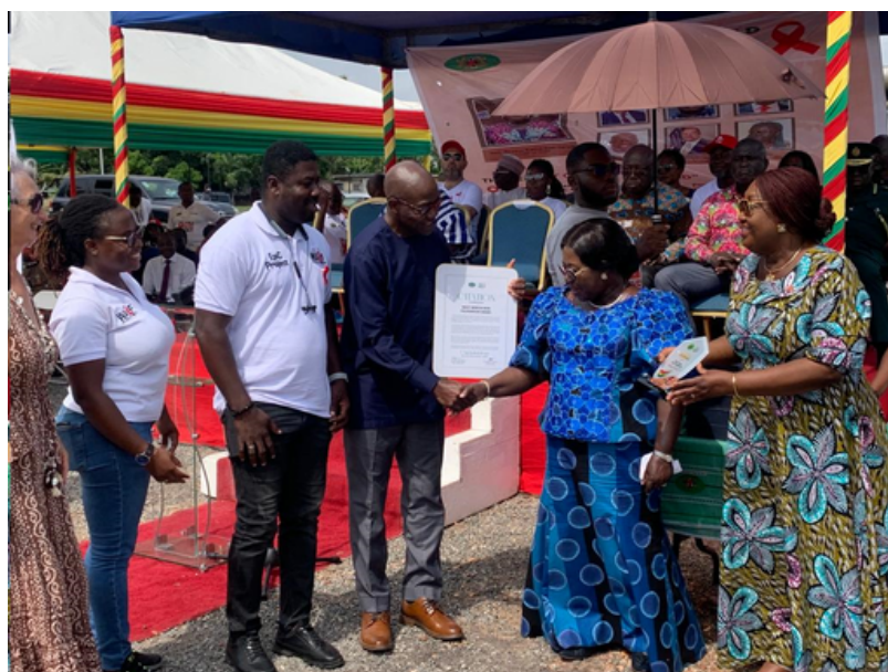
The WAAF team receiving the GAC award and citation At The 2023 World AIDS Day Celebration

Breast Cancer Awareness Month is celebrated every October to raise awareness for the prevention of a disease that affects 2.3 million women worldwide every year. The awareness is to support people diagnosed with breast cancer, to educate people about risk factors, to stress the importance of regular screening, and for fundraising to support breast cancer research. WAAF and IHCC staff celebrated breast cancer awareness month by wearing pink ribbons to show support and offered them to clients as well. Our clinic, the International Health Care Centre also offered free breast screenings to clients who expressed interest in it. We also made an effort to educate the community on breast cancer awareness through our websites and social media channels. Breast Screenings are still open all year round for both men and women as a venue to prevent late diagnosis which makes treatment more complicated and expensive.