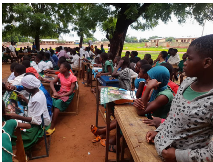
HIV/AIDS Education Exercise